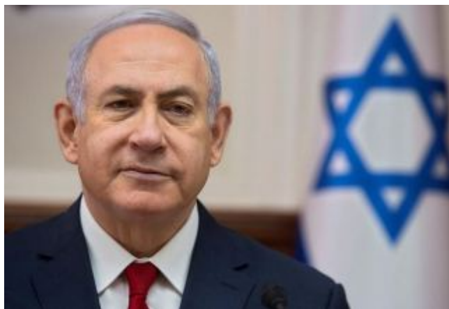
Netanyahu postpones UAE, Bahrain trip due to COVID-19 lockdown

📌 Follow Trend on Telegram. Only most interesting and important news