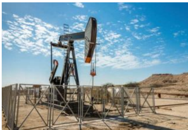
Azerbaijani oil prices on the rise

Follow Trend on Telegram. Only most interesting and important news