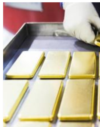
Price of gold in Azerbaijan c