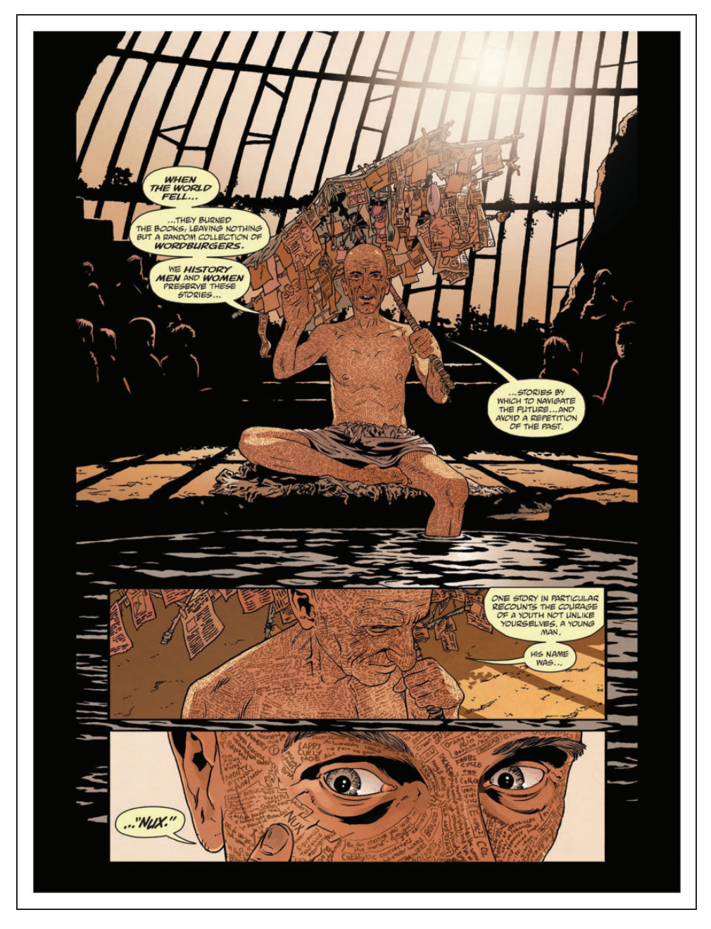
Figure 4. The History Man, tattooed with narrative fragments, stares out at the reader, confronting them with the simultaneous temporalities of the Anthropocene.