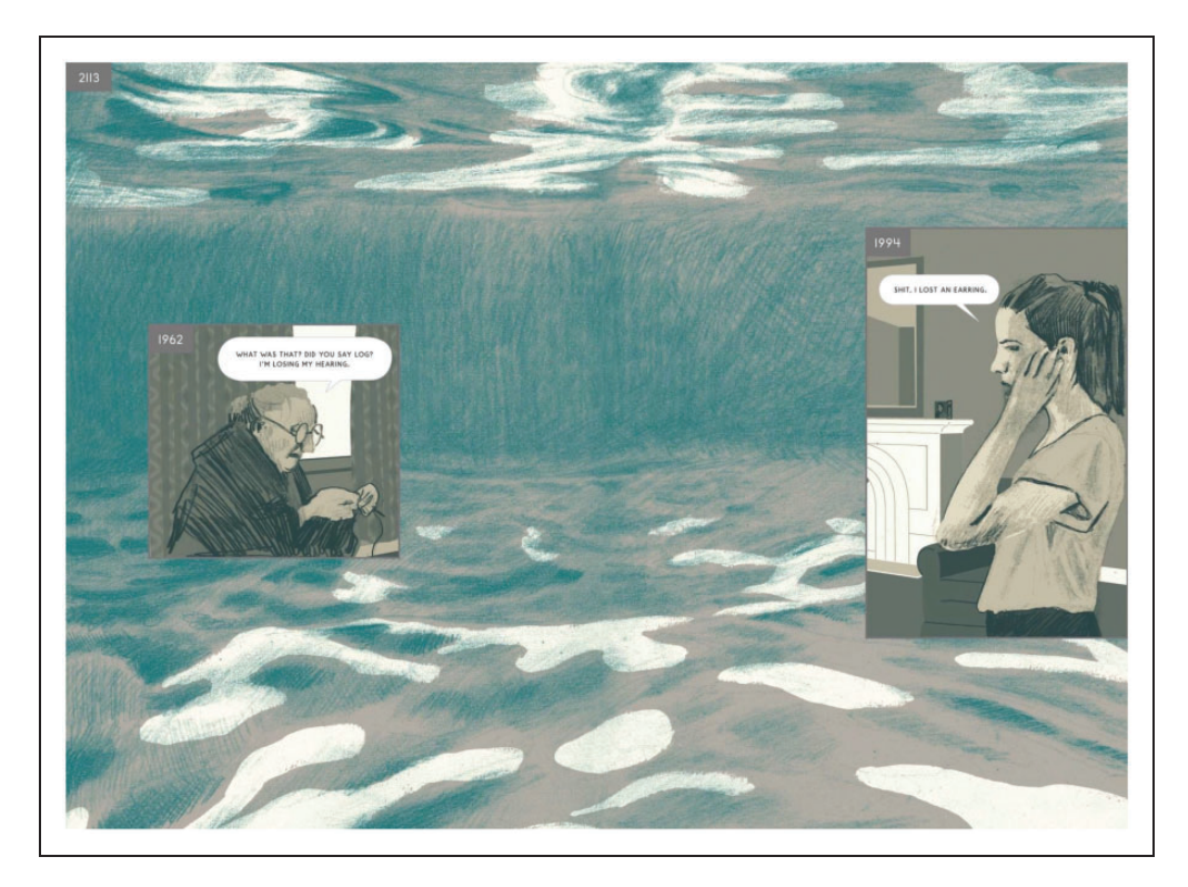
Figure 3. A flood in 2113 has swept away domestic space, which is now entirely under water.

In an effort to make sense of the narrative 'system' of the shorter, six-page predecessor to the later and longer graphic novel, which McGuire also entitled 'Here' (1989), Groensteen (1991) claims to have photocopied each page of the comic and reassembled it into chronological order, from 500,957,406,073 BCE to 2033 CE (this shorter comic did not go as far into the future as 22,175 CE) – only to find that 'all of the sequential action that could be construed as a conventional narrative is exceedingly banal' (Moncion, 2017: 204). Human narratives are rendered inconsequential in Here , extricated from the comic's anthropogenic temporal assemblages through the erosion of their sequential significance. The infrastructural form of comics allows McGuire to construct a posthuman narrative system, one that conjures the anthropogenic temporalities that have rendered Enlightenment humanism and its attendant narrative forms (manifested most obviously in Ghosh's 'serious' novel) banal, if not obsolete.