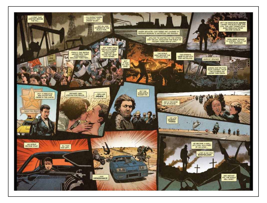
Figure 6. The relatively geometric infrastructure of Mad Max: Fury Road breaks down into a series of fragmented, temporally disparate scenes.