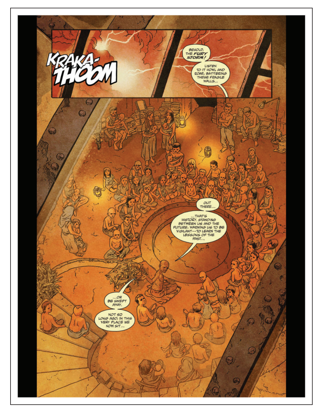
Figure 5. The 'fury storm' beats down on the infrastructure of the Citadel and the narrative infrastructure of the comic.

There are clear synergies between apocalyptic narratives and the comics form. As Fuist (2016: 97) observes, Mad Max: Fury Road , the film, 'like many postapocalyptic stories, identifies human beings as compulsive producers of culture', suggesting that, 'when stripped of our institutions, we rebuild them anew'. Comparably, the infrastructural form of graphic