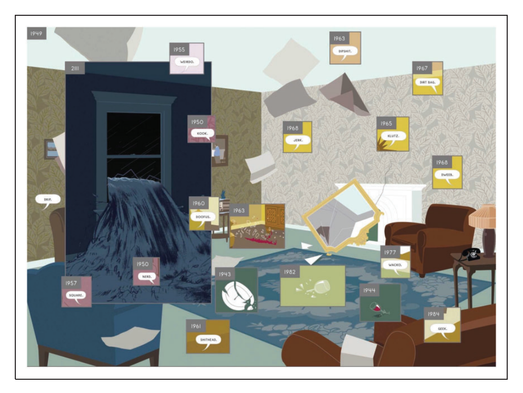
Figure 2. Here's busiest page contains multiple panels from different historical moments.

water that floods into the room visualises in this moment of rupture the intrusion of geological into human time frames . The linguistic echoes between timeframes and comics frames are not lost on McGuire, who instead exploits this synergy to evoke an atmosphere of 'impending calamity, [of] being "out of time" (Perry, 2018). And indeed, we are out of time: later in the comic we find that, just two years later, in the year 2113, the space of the present is now entirely under water, the flood having swept away all traces of twentieth- and twenty-first-century human life (see Figure 3).